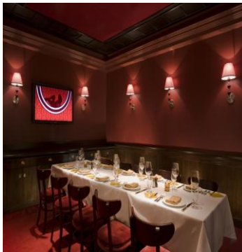
Room 400 10-20 Guests