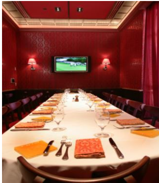
Room 300 15-30 Guests

The restaurant has four private dining options that reflect the ambiance of the main dining room, with crimson walls adorned with specialty lighting and framed mirrors. One private room can accommodate up to 20 guests, another can hold up to 30, and the largest private dining room seats up to 100 guests. The rooms are equipped with plasma screens, pc connections and wireless internet access and are available without a room rental fee.