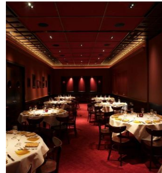
Room 200/250 30-100 Guests